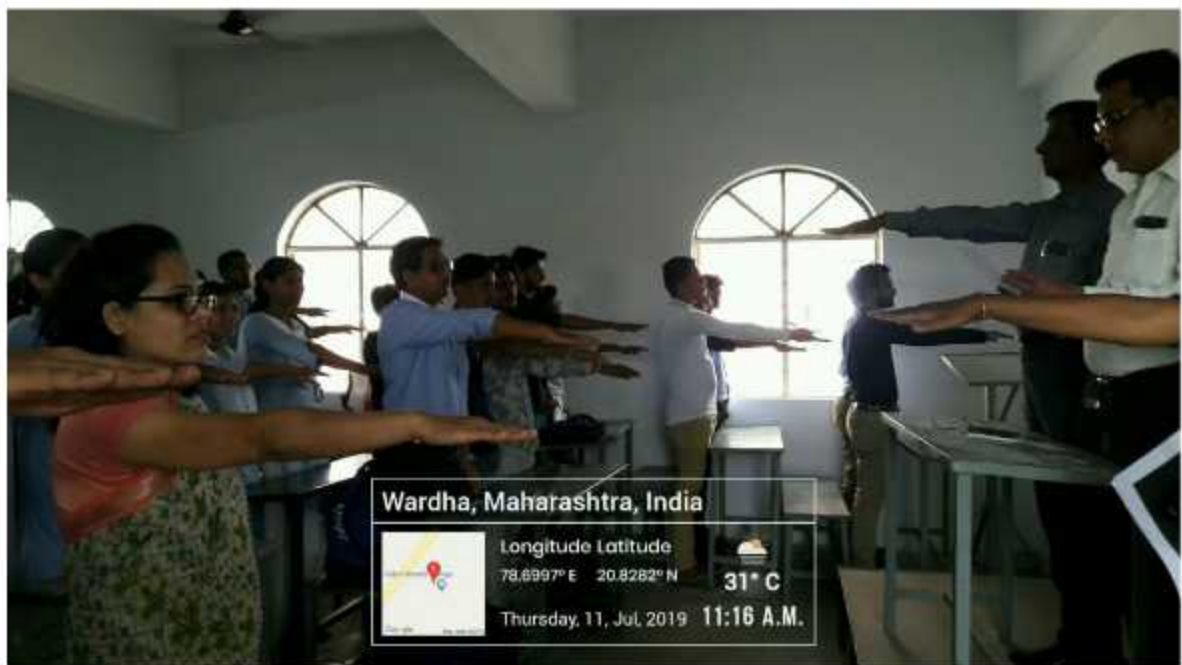
On this occasion, students were given an oath to not consume tobacco