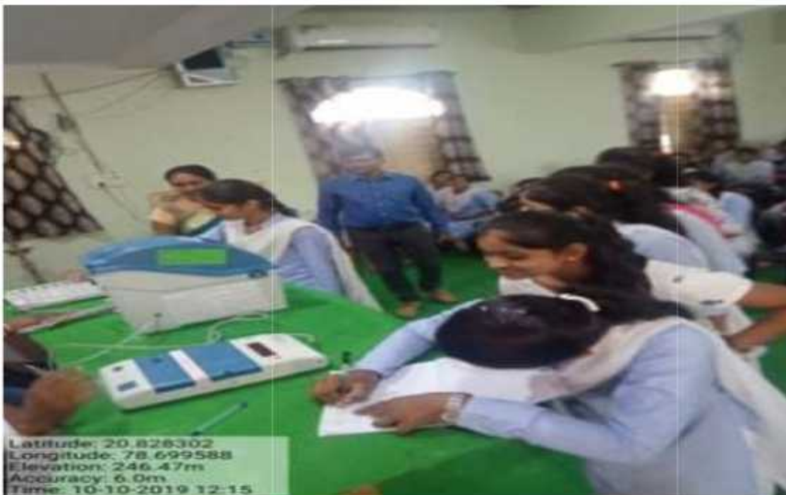
Demonstration and training of evm and cpu machine