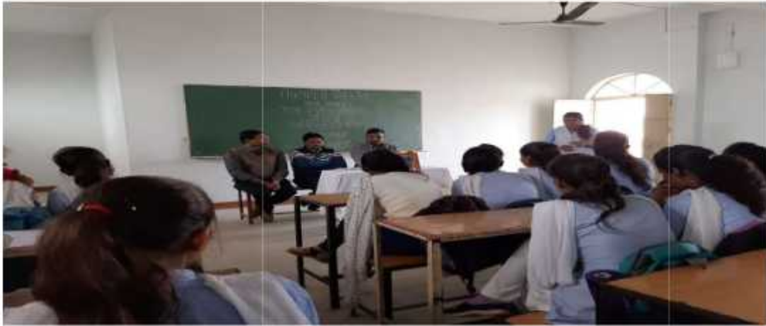
Student was expressed her thoughts On occasion of Elocution Competition