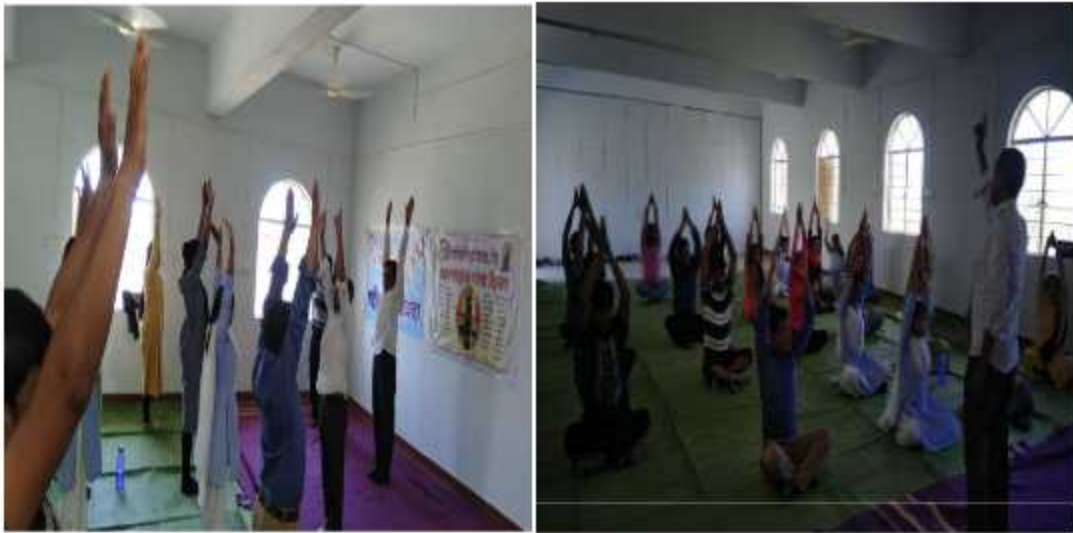
The participants were practicing yoga