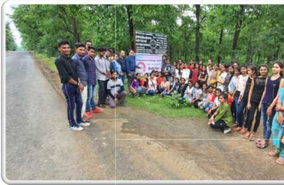
Biological excursion tour for all B.Sc. I, III, and V semester on date 28/08/2019 at Basic Seed Multiplication and Training Centre (BSMTC), Central Sericulture Board, Devlipar Dist. Bhandara.