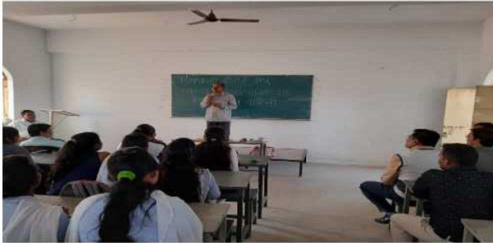
Mr. Nikode delivered the chief guest address on occasion of the elimination of superstitions program