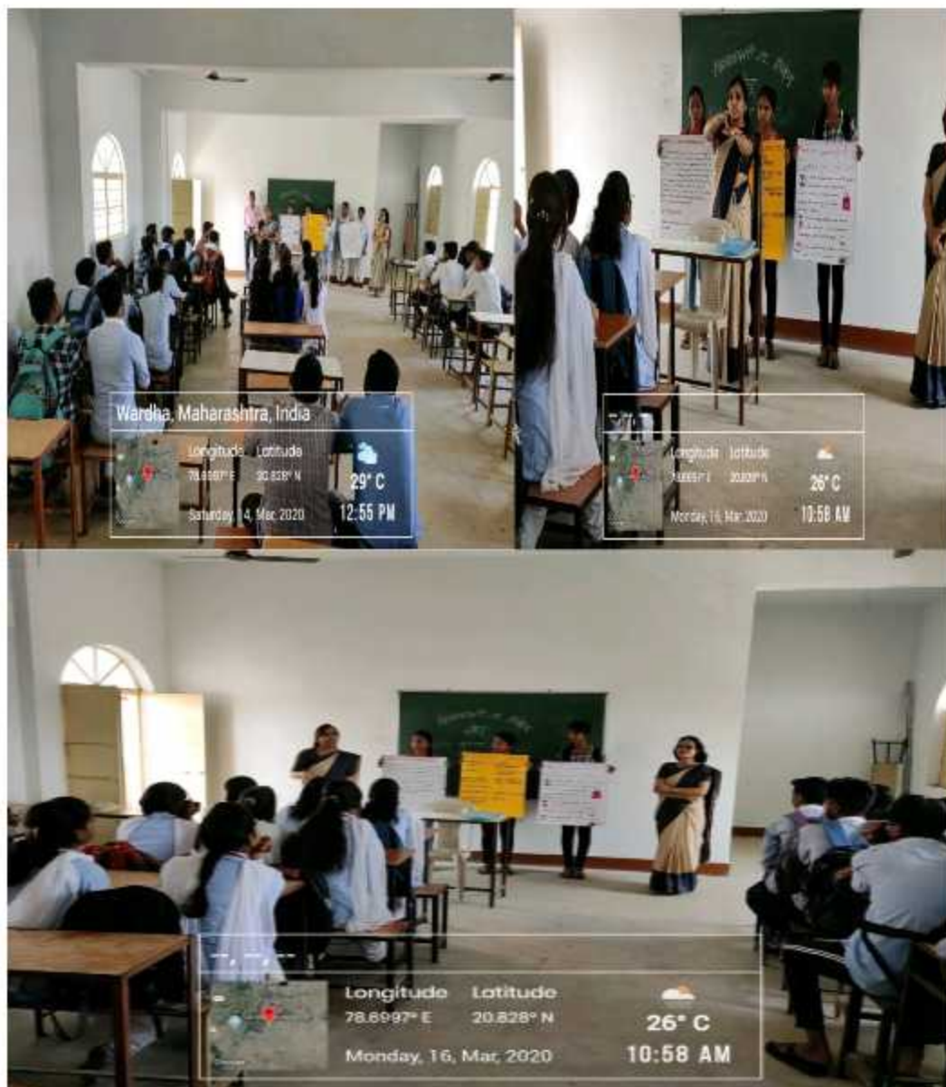
Awareness about the terror of Novel Corona Virus Infection (COVID-19): “Awareness activity for Vidyabharti College staffs and students”