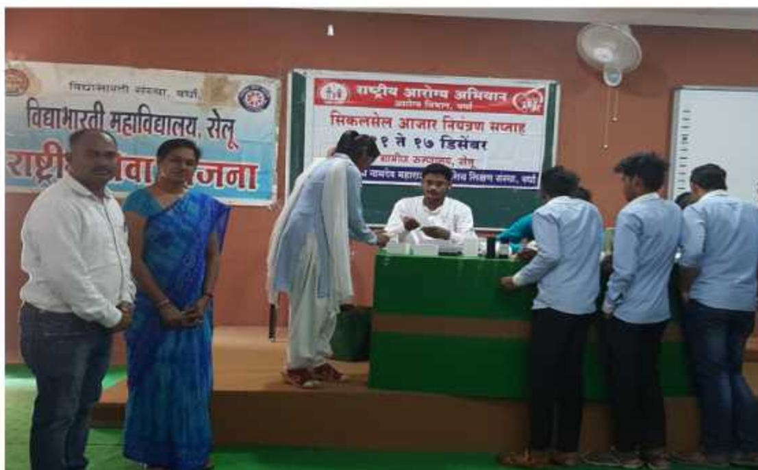
Free check-up program for student

wahgmare madam was given the information on occasion of sickle cell awareness program